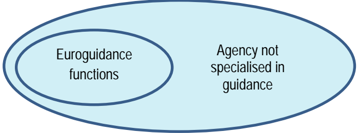
Picture 2: Euroguidance centres within agencies (hosting organisations) which are not specialised for career guidance

In all these cases Euroguidance centres perform only (or mostly) the role which is defined by the contract with the European Commission (See section "Common goals and activities of Euroguidance centres"). This model is graphically presented in Picture 2.